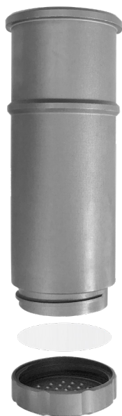
Sample Holder Q-Cup

The EDGE is a sequential automated pressurized fluid extraction system that is faster than Soxhlet and simpler than other automated extraction systems. With the Q-Cup® Sample Holder, it is perfect for efficiently preparing samples for US EPA 3545A. The EDGE automates the extraction and washing process and provides a filtered and cooled extract.